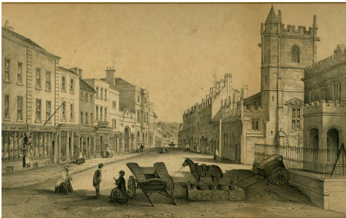
High Street, Shaftesbury. Cir. 1830s

Turn right immediately to go to Abbey Walk, the site of the great Abbey gate. The former school is on your left and the Westminster Memorial Hospital is on your right. At the end of Abbey Walk is the War Memorial, in the style of a Celtic cross. Then turn left onto Park Walk again to get back to the Town Hall, enjoying the views on your right once again.