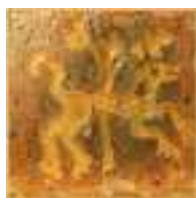
Tile with dog design design

You can see some of the tile designs on this website: