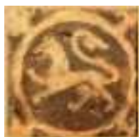
Tile with lion design